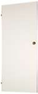
AHSAP KAPI WOODEN DOOR