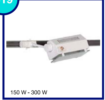
HALOJEN SPOT HALOGEN SPOT