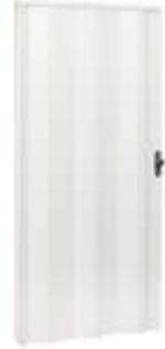
AKORDİYON KAPI ACCORDION DOOR