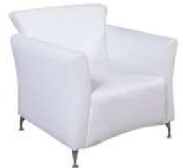
TEK KİŞİLİK BEYAZ DERİ KOLTUK ARMCHAIR