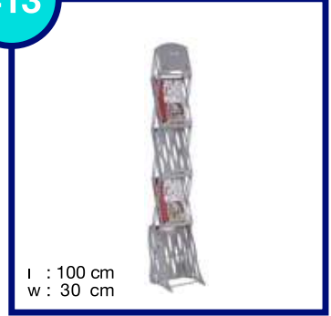
BROSÜRLÜK BROCHURE RACK