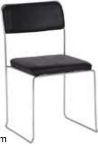
DERİ SANDALYE LEATHER CHAIR