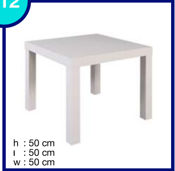
SEHPA COFFEE TABLE