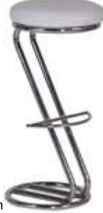
BAR SANDALYESİ BAR STOOL