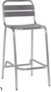
METAL BAR SANDALYESİ METAL BAR STOOL