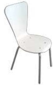
AKÇA SANDALYE MAPLE WOODEN CHAIR