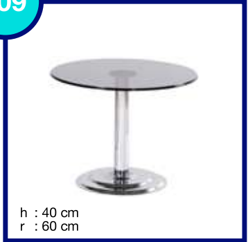
CAM SEHPA GLASS COFFEE TABLE