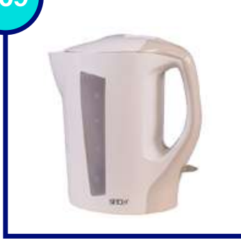
SU ISITICI KETTLE