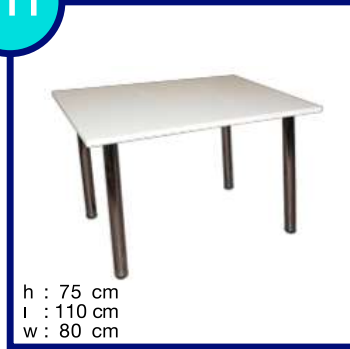
DIKDÖRTGEN MASA RECTENGULAR TABLE