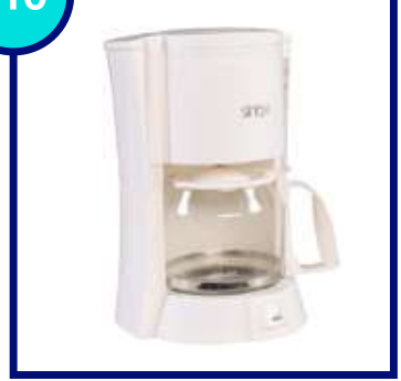
KAHVE MAKİNESİ COFFEE MACHINE