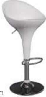
BAR SANDALYESİ BAR STOOL