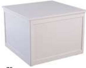
SERGI KÜPÜ DISPLAY CUBE