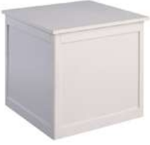
SERGI KÜPÜ DISPLAY CUBE