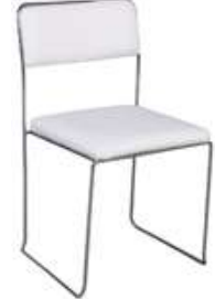
DERİ SANDALYE LEATHER CHAIR