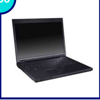
DIZÜSTÜ BILGISAYAR LAPTOP