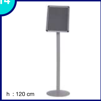
YÖNLENDİRME PANOSU ROUTING BOARD