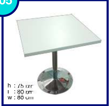
AHSAP MASA WOODEN TABLE