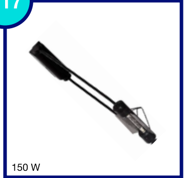
SİYAH HALOJEN SPOT BLACK HALOGEN SPOT