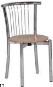
AHSAP SANDALYE WOODEN CHAIR