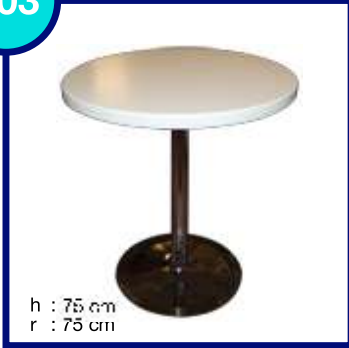
LAKE MASA WOODEN TABLE