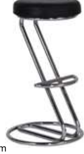
BAR SANDALYESİ BAR STOOL