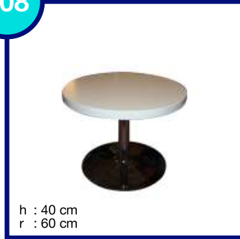
LAKE SEHPA COFFEE TABLE