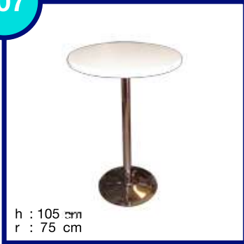
LAKE BAR MASASI WOODEN BAR TABLE