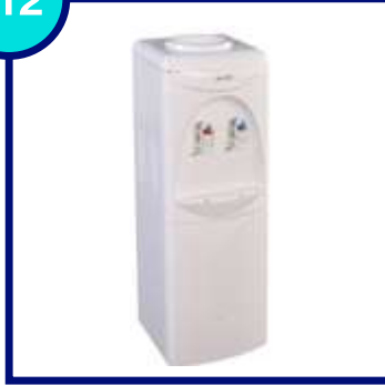
SU MAKİNESİ WATER FOUNTAIN