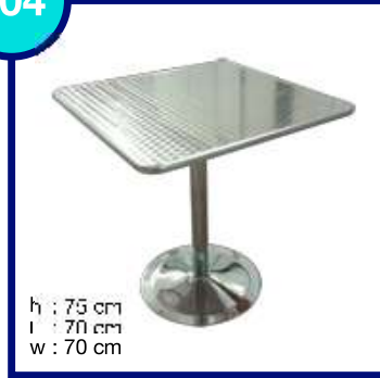
METAL MASA METAL TABLE