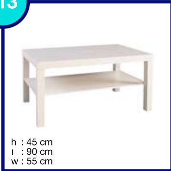
SEHPA COFFEE TABLE