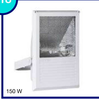
METAL HALİDE HQL