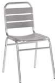
METAL SANDALYE METAL CHAIR