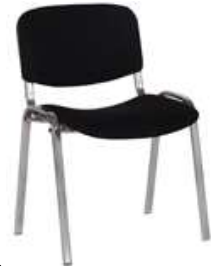
SİYAH KUMAŞ SANDALYE BLACK FABRIC CHAIR