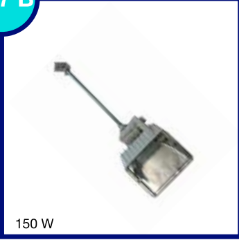
BEYAZ HALOJEN SPOT WHITE HALOGEN SPOT