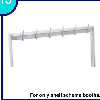
SİSTEM ASKILIK COAT SYSTEM