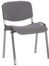
GRİ KUMAŞ SANDALYE GRAY FABRIC CHAIR