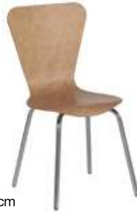
KAYIN AHSAP SANDALYE BEECH WOODEN CHAIR