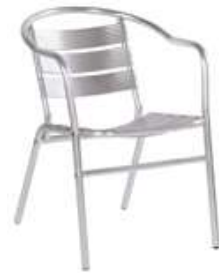
METAL SANDALYE METAL CHAIR