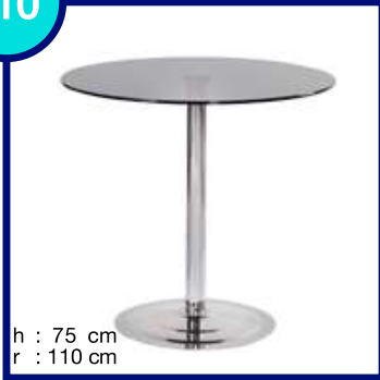
CAM MASA GLASS TABLE