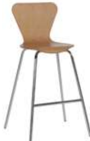
KAYIN AHSAP BAR SANDALYESİ BEECH WOODEN BAR STOOL