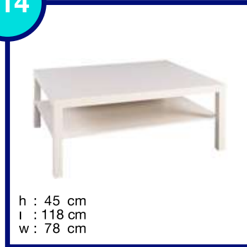
SEHPA COFFEE TABLE